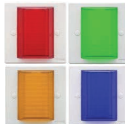
MDR-303 Series Siren with LED Flash Lamp