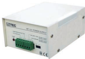
MT-123 E - Lock Power Supply