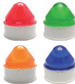
MDR-381 Series Siren with LED Flash Lamp