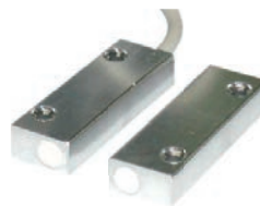
BR - 2072 Door & Gate Monitor