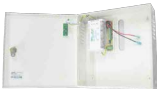
MSP-125T E - Lock Power Supply