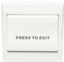
MDR-202 Mechanical Button